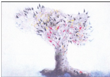
Annex 8 Katugaha + Mythical landscapes IV Mixed media on canvas, 56cm 81cm