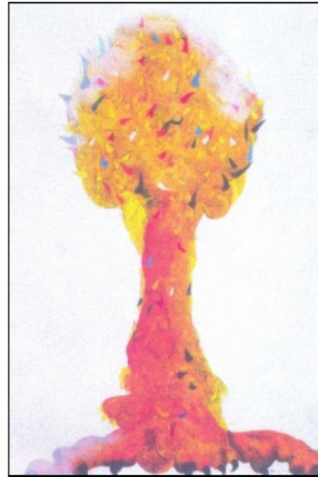
Annex 6 Katugaha + Mythical landscapes III Mixed media on canvas, 81 cm 56cm