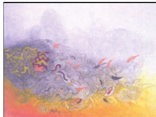
Annex 3 Katugaha + Mythical Landscapes V Mixed media on canvas, 22cm 29cm