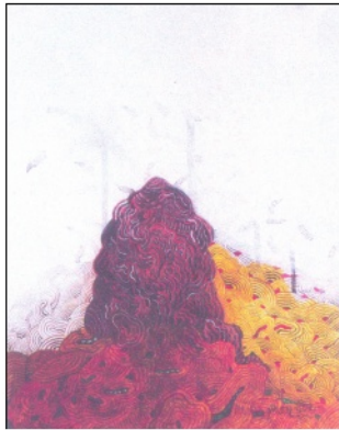
Annex 7 Katugaha + Mythical landscapes XI Mixed media on canvas, 29cm 22cm