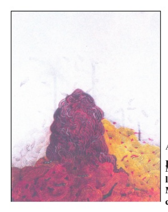
Annex 7 Katugaha + Mytincal landscapes XI Mixed media on canvas, 29cm 22cm