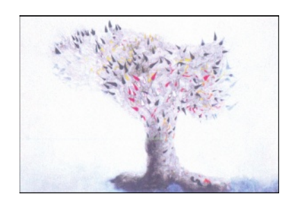
Annex 8 Katugaha + Mythical landscapes IV Mixed media on cawas, 56cm 81cm