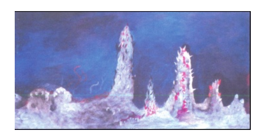
Annex 9 Katugaha + Mythical landscape XIV Mixed media oncanvas, 46cm 92cm